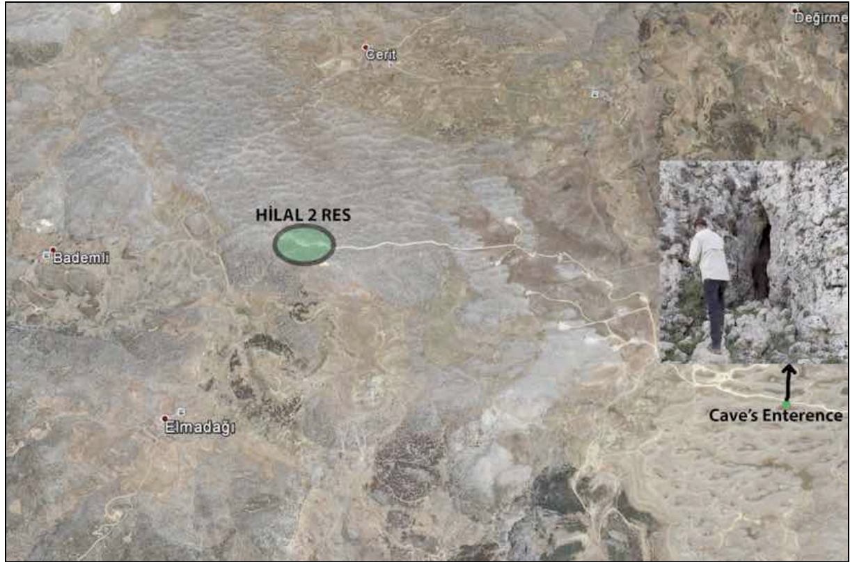
Figure 4. Location of the Cave and the Project Area