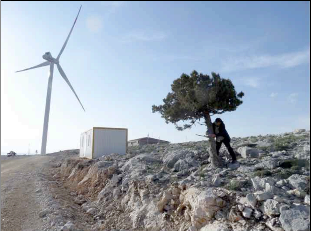
Photo 2. Installation of Bat Detectors by the 2U1K Team

Bat detection equipment used during the site study include detectors recording bat sounds at night time (BatBox Griffin and Pettersson D500X), detection equipment that converts bat sounds to audible frequency (BAAtBox Duet) and another type of bat detector that records in the forms of time expansion (Petersen D 240X).