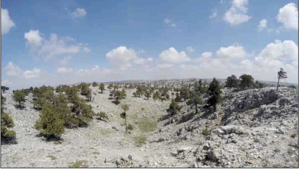
Photo 1. Juniper Trees around the Project Area

The Project Area of Hilal 2 WPP is located within the boundaries of Karaman province. Elmadağı and Bademli villages lie to the south of the Project site, and Cerit village to the north. The general vegetation is comprised of juniper trees that define main characteristics of the region, and rare black pine trees (See Photo 1 below).