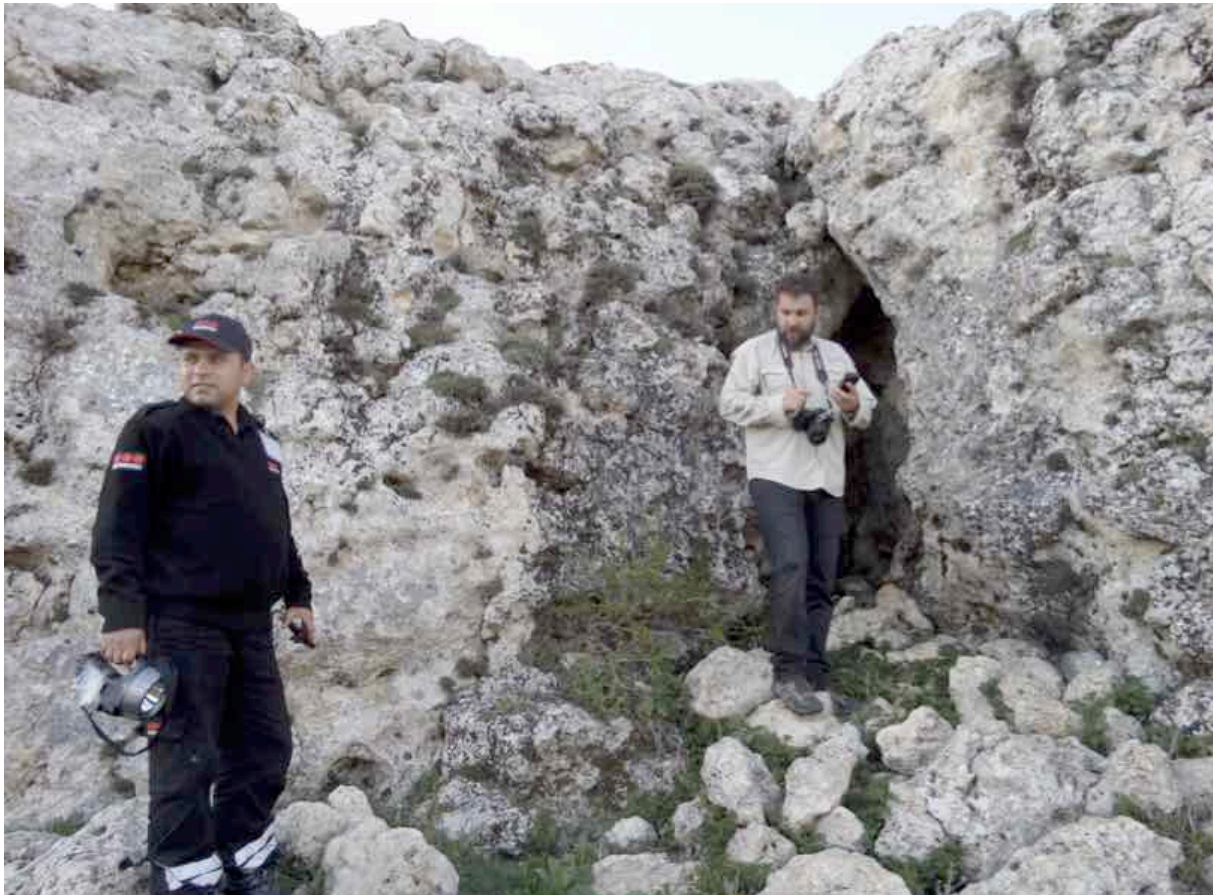
Photo 3. Site Observations at a Cave near the Project Area