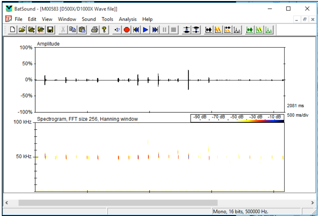
Figure 2. Batsound Software Version 4.2 Used in Analysis of Recorded Sounds

Special software has been used for showing graphical and sonogram presentations of recorded sounds (BatSound real-time spectrogram analysis software, version 4.2; BatScan version 9.8). Analysis of recorded sounds with these software are shown in Figure 2 and Figure 3.