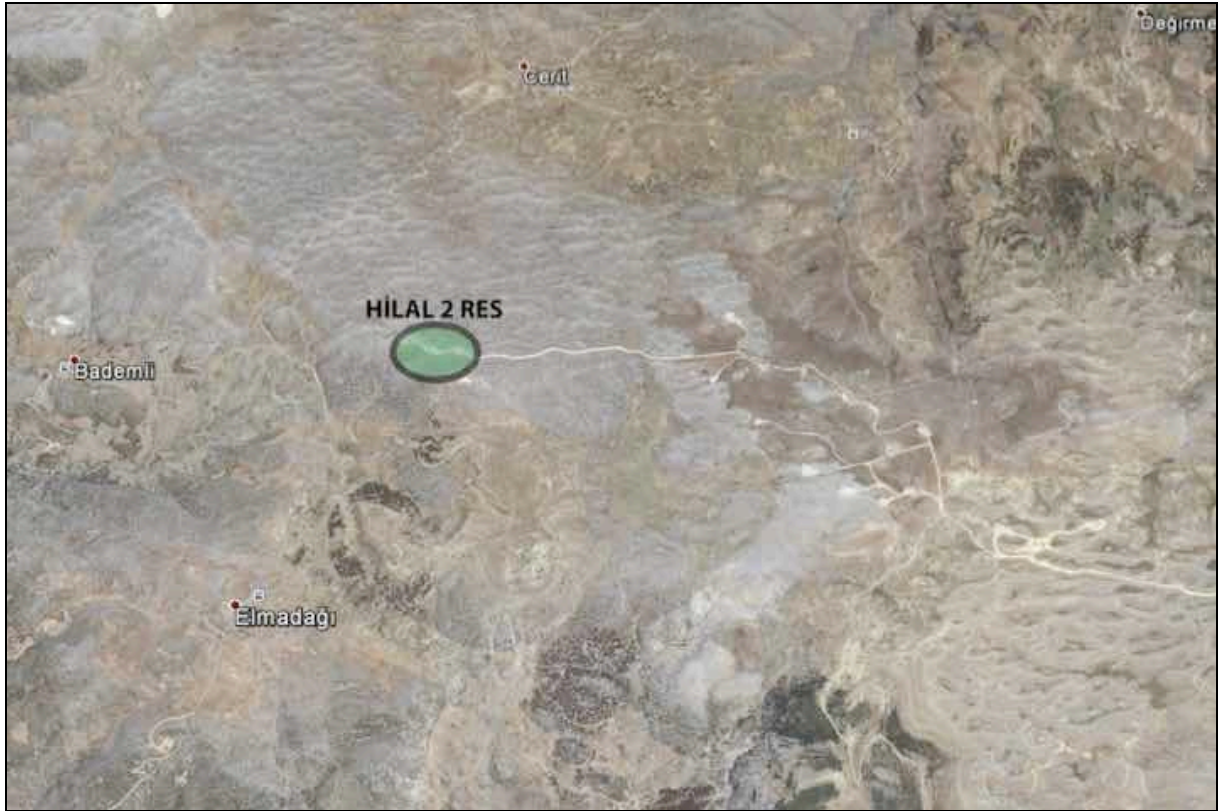
Figure 1. Geographical Location of the Project